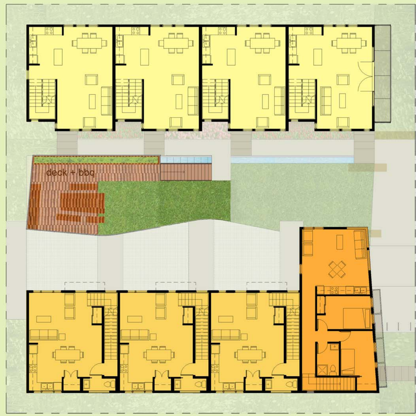
LEVEL 2 PLAN