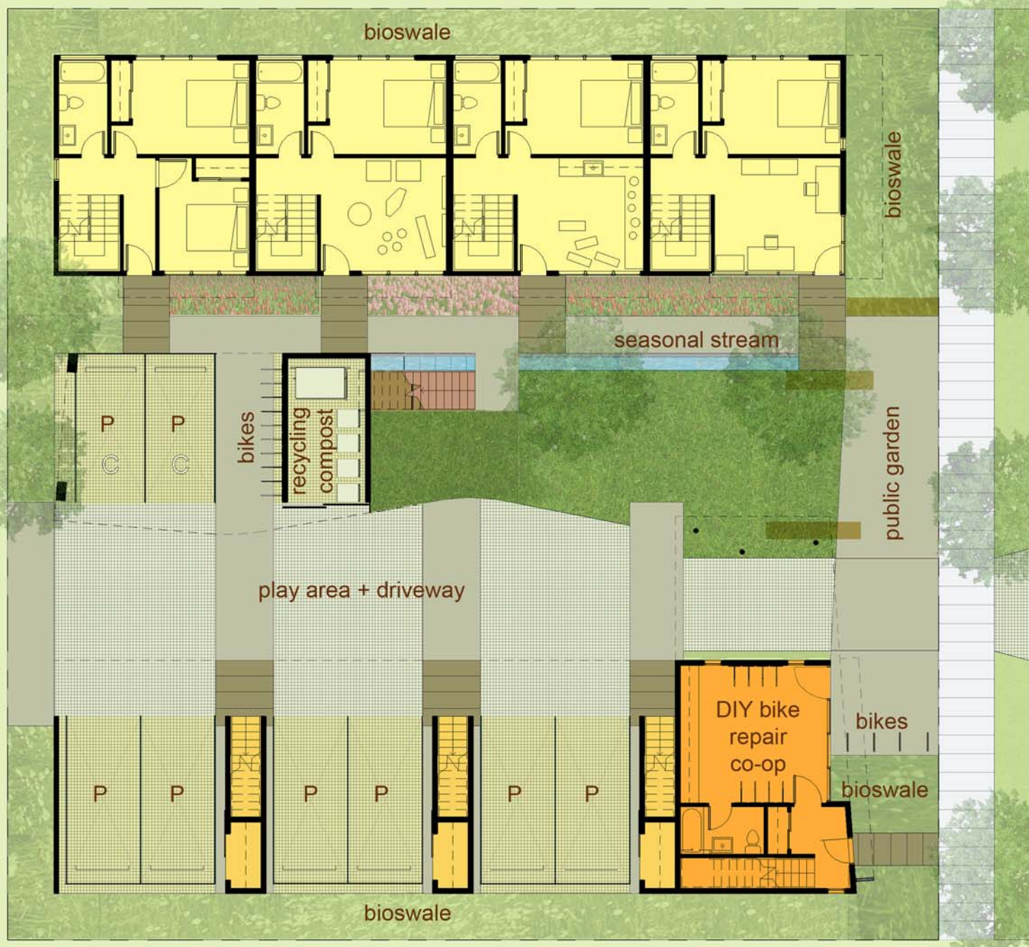
LEVEL 1 PLAN