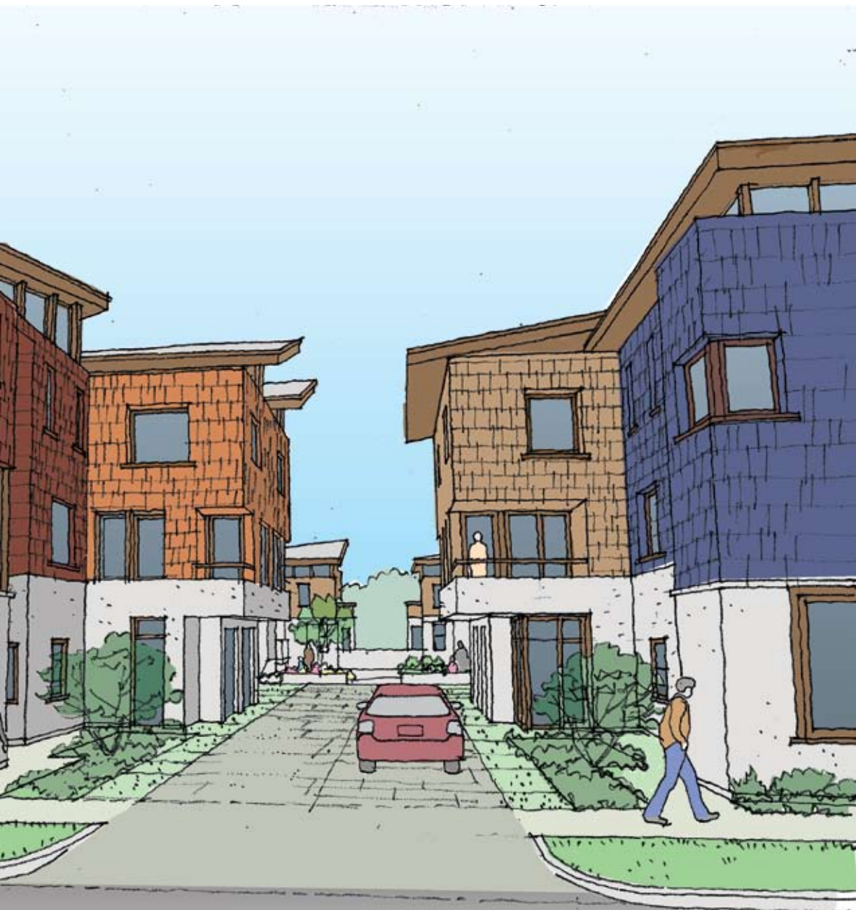
INTO MEWS FROM STREET