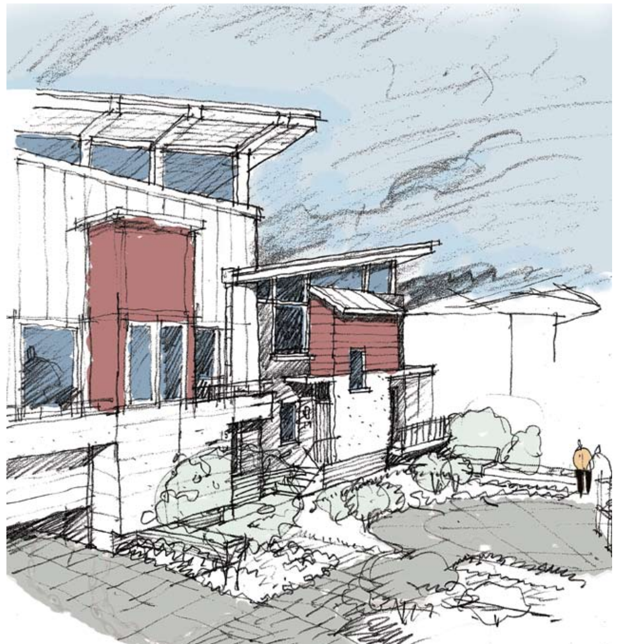
PERSPECTIVE LOOKING INTO COURTYARD FROM BALCONY