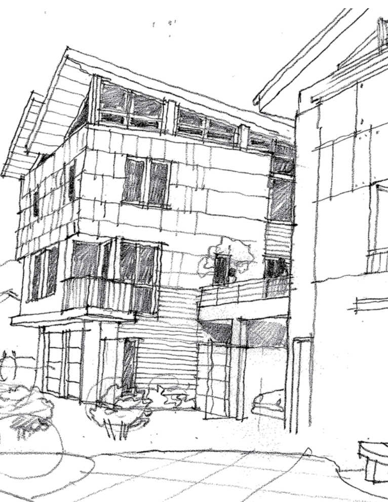
EARLY SKETCH OF BUILDING MATERIALS