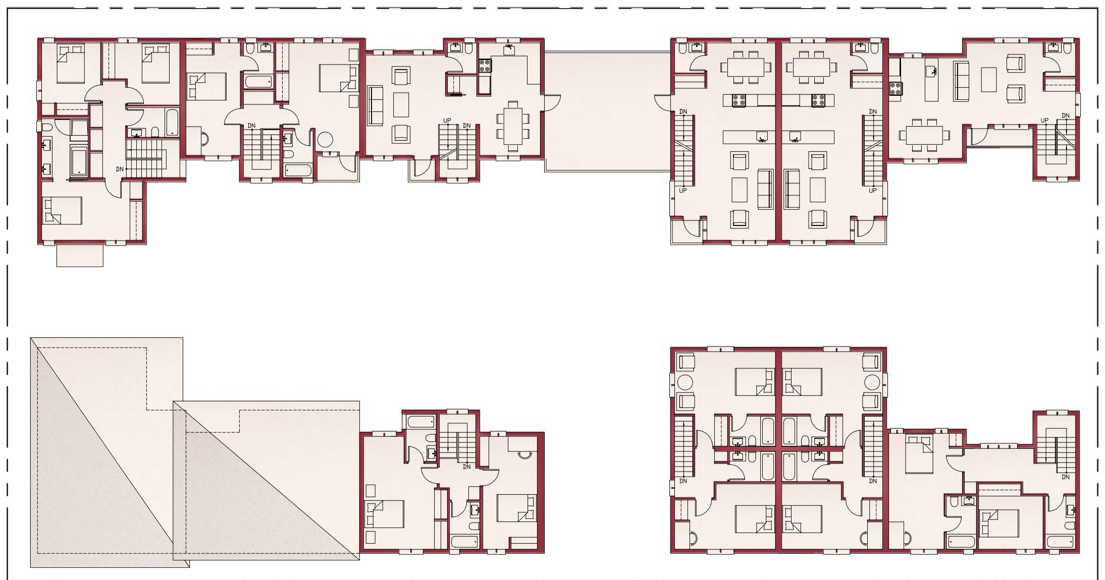
SECOND AND THIRD FLOOR PLANS AT 1/16" = 1'-0"