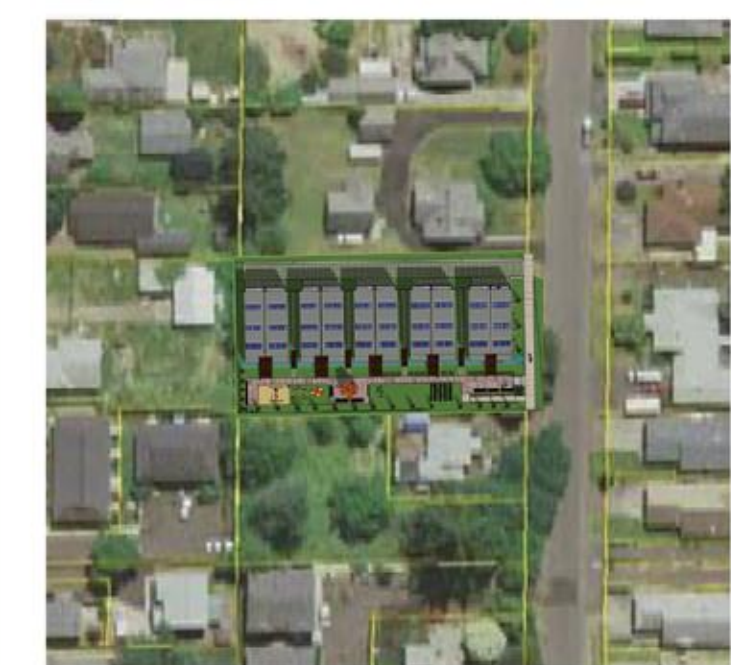
SITE IN CONTEXT