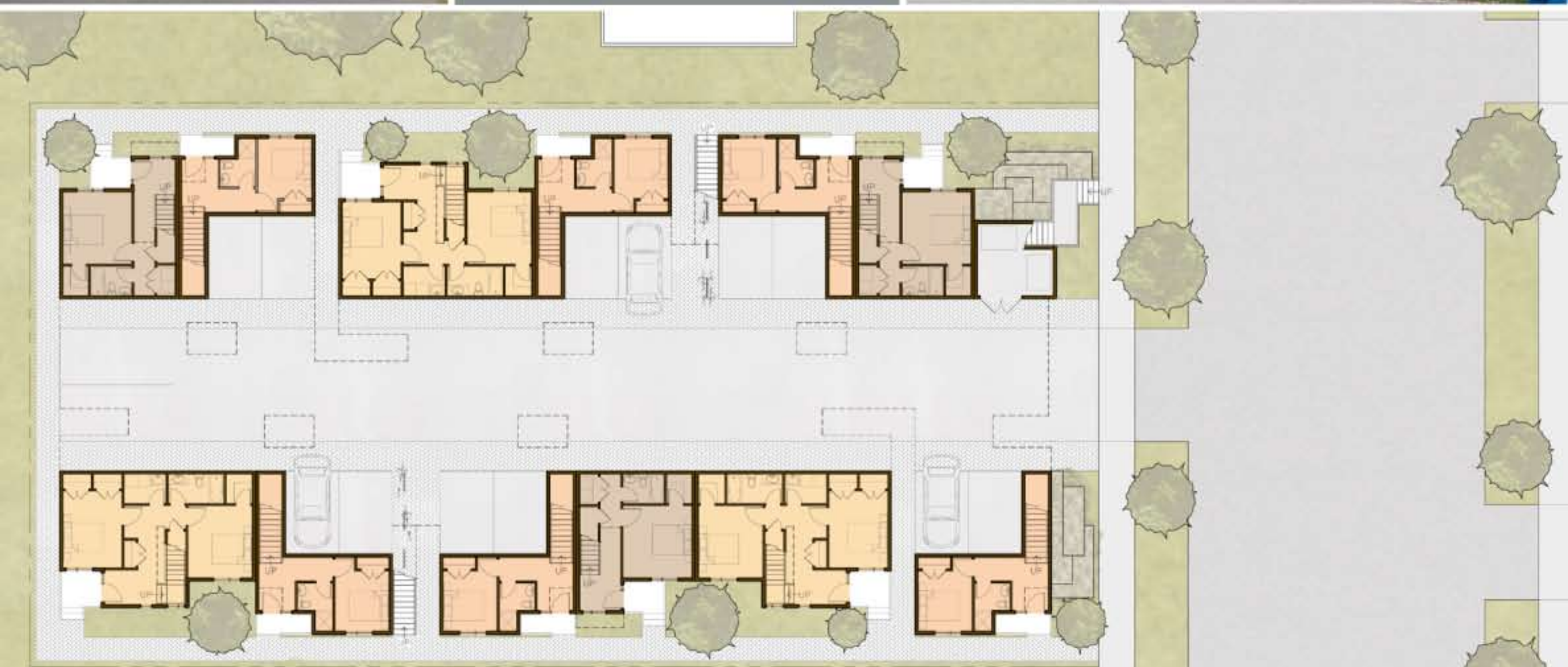
Site Plan / Level 1 Plan 0 4 8 16